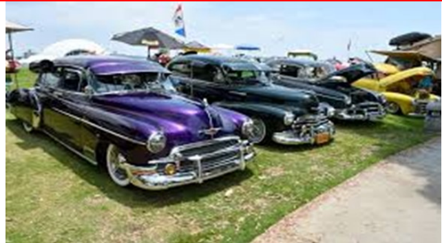
Classic Low Rider Cars on Display

*BONUS* FREE GROCERY BOXES FREE GIVEAWAYS