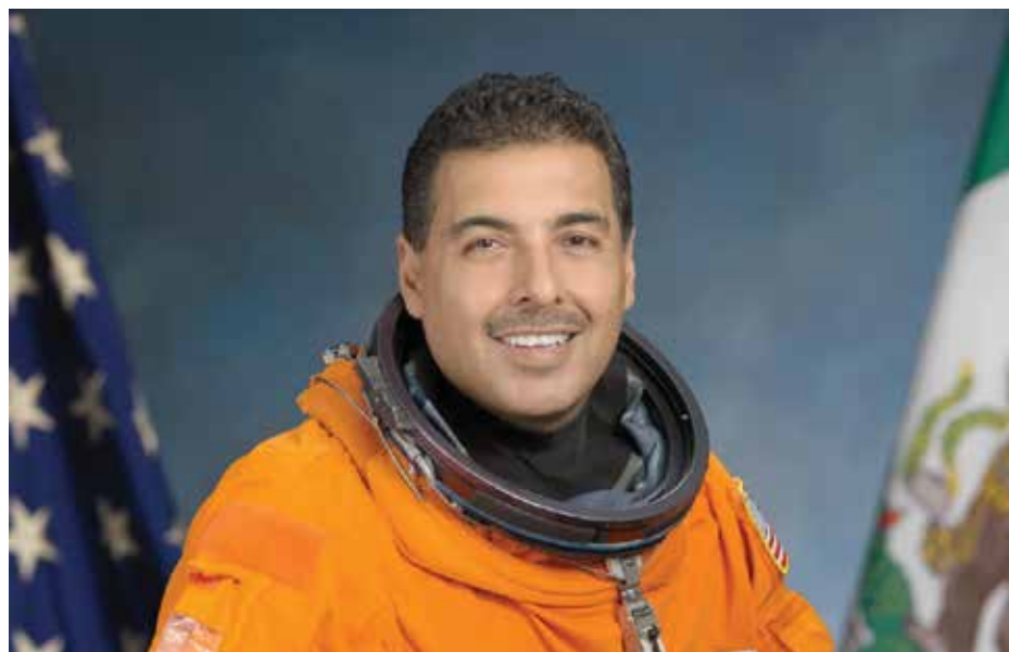
Astronaut José M. Hernández