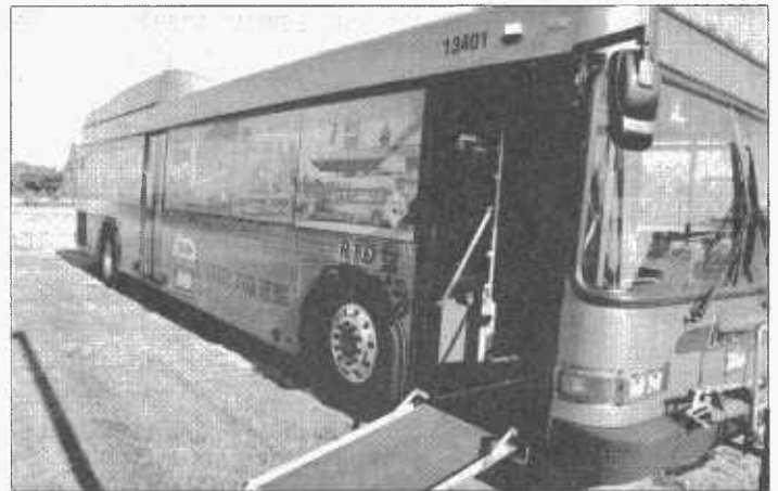
LEFT: Book racks, such as this one, will soon be found on RTD buses in San Joaquin County. RIGHT TOP: Health Plan of San Joaquin held a book drive Aug. 19 at its French Camp headquarters, seeking books for the RTD Books on Buses program. RIGHT BOTTOM: An RTD bus decorated for the agency's 50th anniversary was parked at Health Plan of San Joaquin headquarters to collect the books.

H ealth Plan of San Joaquin held a day-long Books on Buses book drive Aug. 19 in its French Camp parking lot.